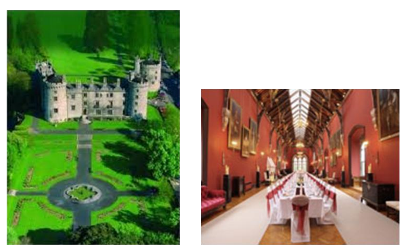
Kilkenny Castle exterior and interior views