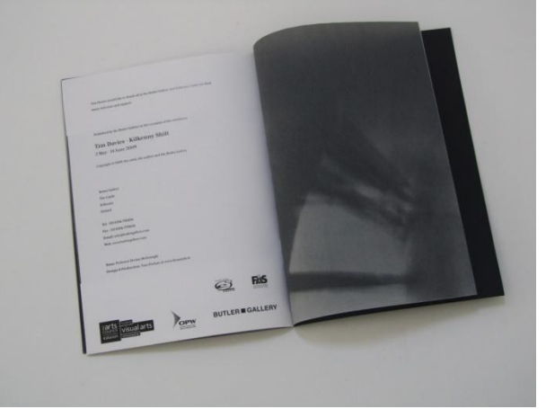
Kilkenny Shift exhibition catalogue, the Butler Gallery, Kilkenny