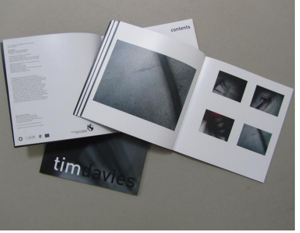
Kilkenny Shift in Between a Rock and Hard Place catalogue, Glynn Vivian, Swansea