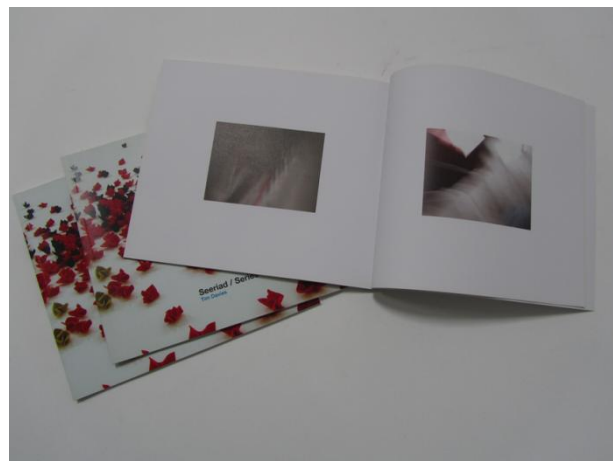
Kilkenny Shift in the Seeriad/Series exhibition catalogue, Sihtasutus Tallinna Kunstihoone Fond, Tallinn NIRAD

Wales Institute of Research in Art & Design