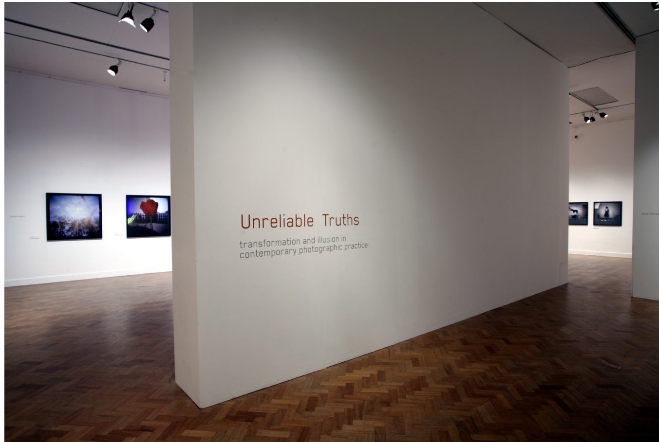
Unreliable Truths , Glynn Vivian Gallery, Swansea 2008

Preparatory works exhibited at Unreliable Truths , Glynn Vivian Gallery, Swansea 2008