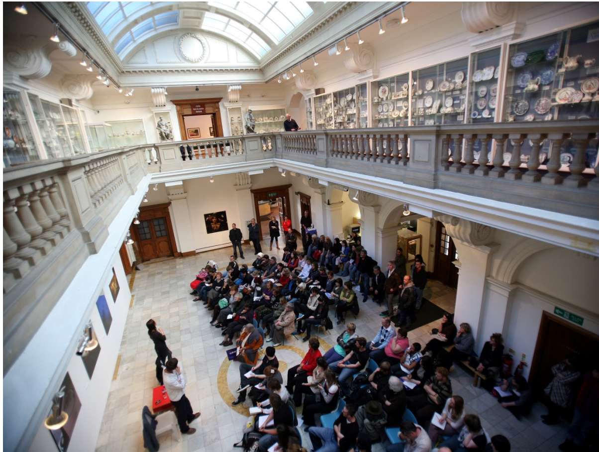
Unreliable Truths symposium, Glynn Vivian Gallery, Swansea 2008