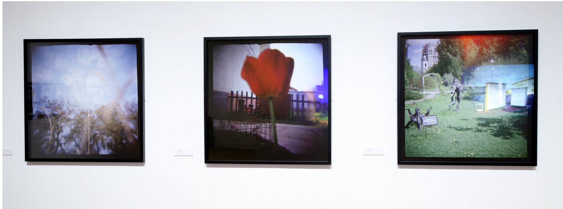
Installation view, Unreliable Truths