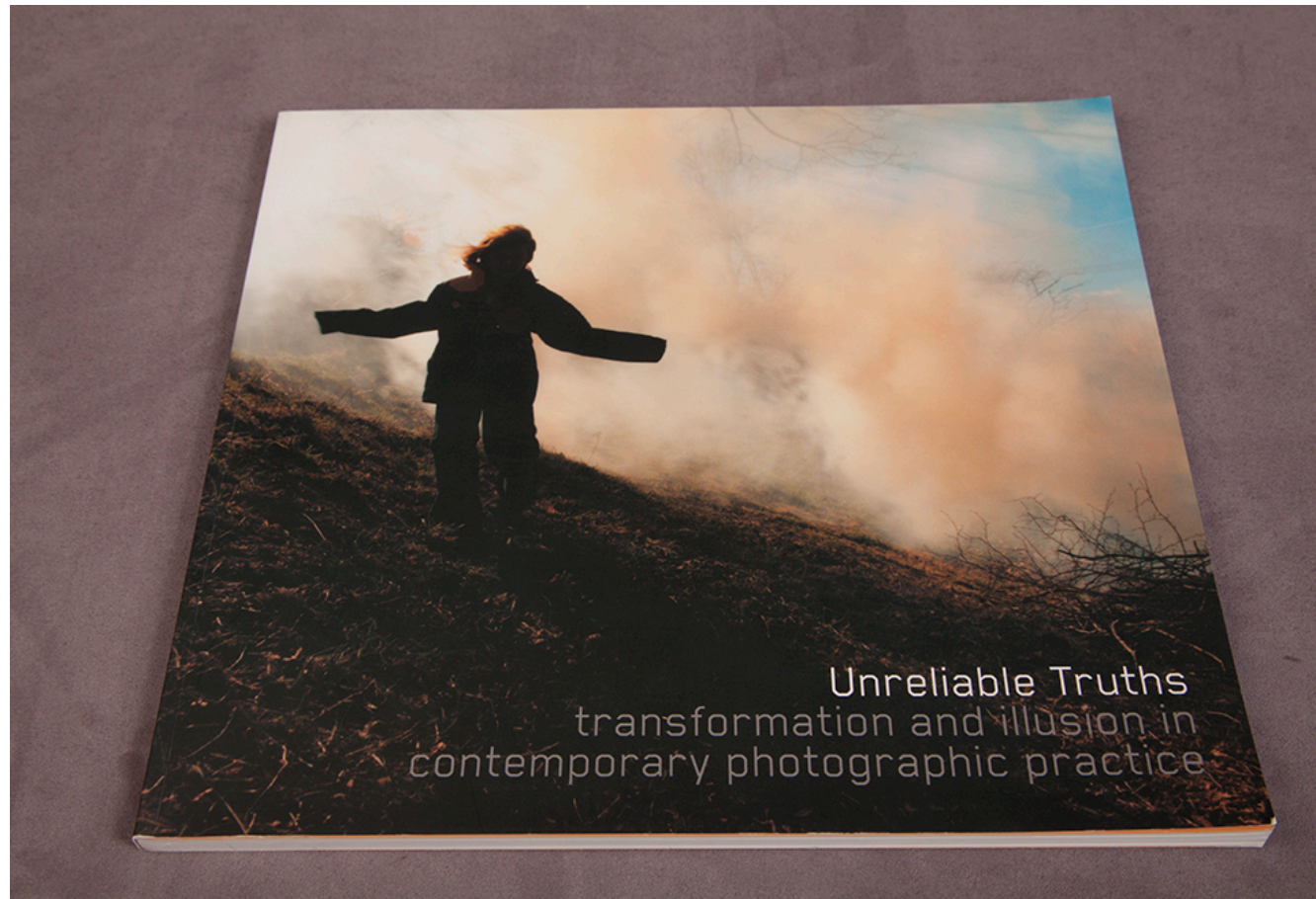
Catalogue, Unreliable Truths