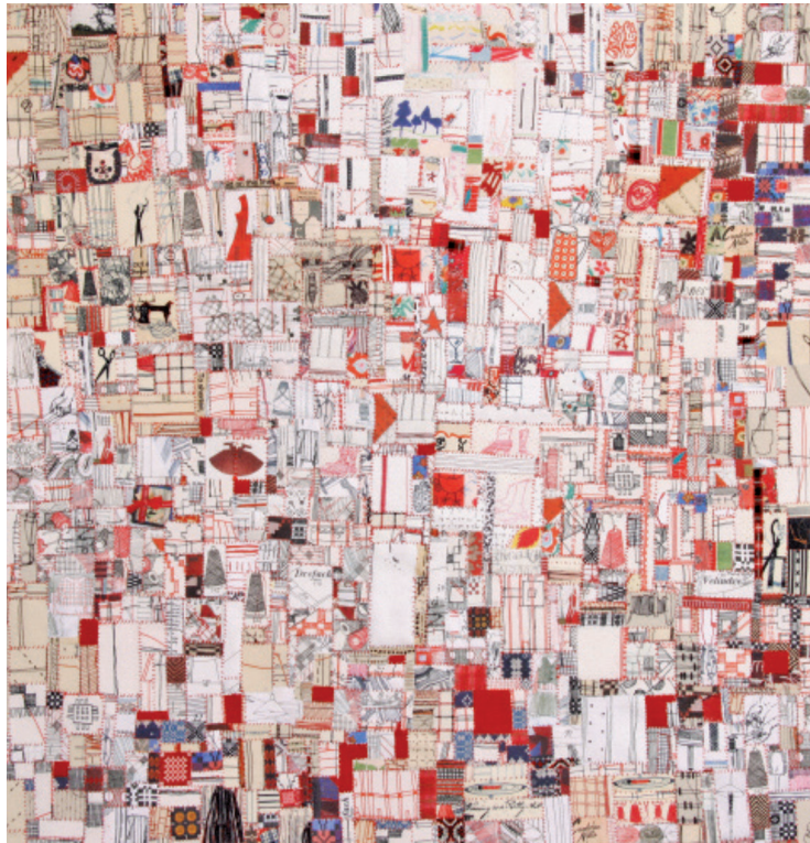
Figure 7: Griffiths-Jones, J. Journey Quilt , 2008-09, photograph, text.

nostalgia, in the sense of the return to the scene of loss, not as an expression of a longing for something to be as it once was” (Rugg, 2005) Griffiths Jones’ discovery of the processes involved in the making of the woolen cloth leads us to an understanding of each individual square symbolising the salvation of the remnants of our nation’s identity.