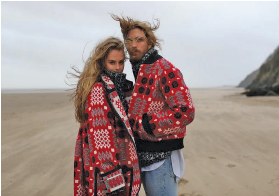
Figure 6: Hicks, J and Tomlin, D. Coracle , 2015, photograph, text.

The reworkings of the carthen blanket by the brand Coracle and Welsh woollen mills such as Melin Tregwynt gives both a sense of past and contemporary value in our modern culture.