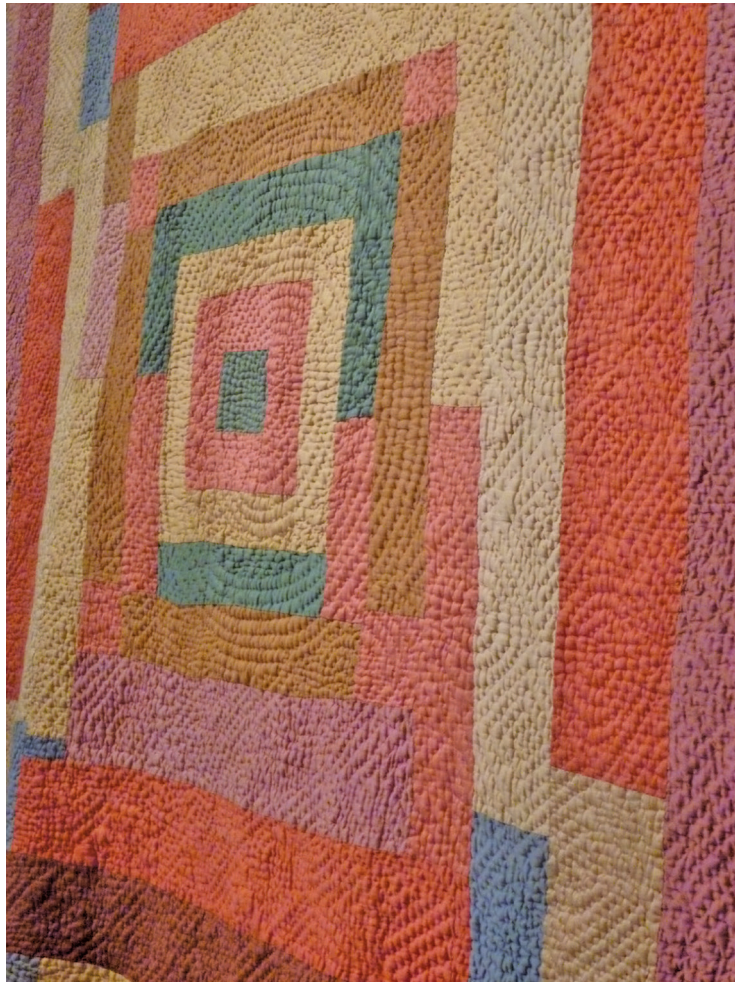
Figure 2: National Quilt Museum, Sarah Jane Morgan, Untitled , 1920, stitched cotton quilt, photograph, exhibition.

in a museum context, they become individual archives of the past, every delicate stitch providing a warmth of memories of a past, they exude a presence, they become a language.