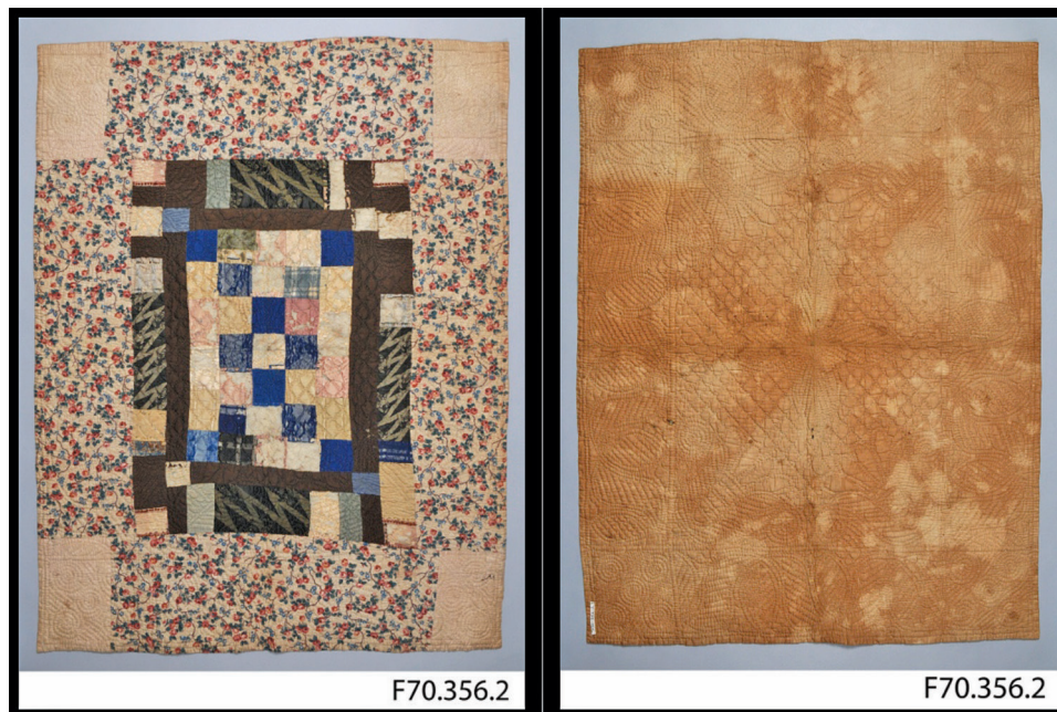
Figure 3: National Museum of Wales St Fagan archives, Pembrokeshire Cot Quilt , date unknown, stitched silk/cotton, photograph.

village quilter when a new baby was due, this quilt would be passed down and used by each new addition to the family (Jones, 1997: 37).