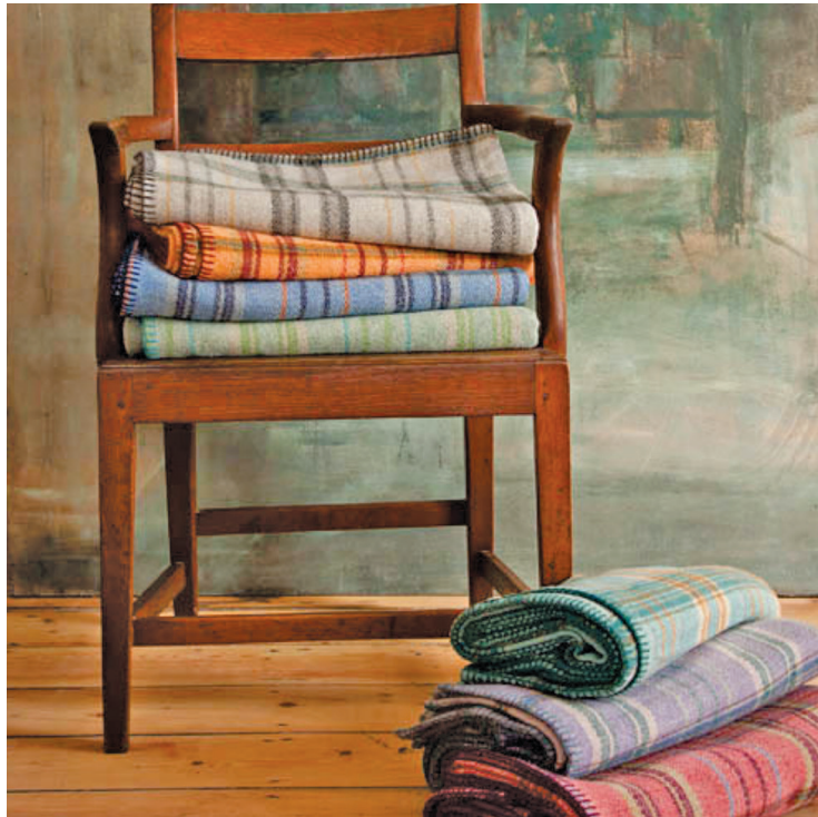
Figure 4: Melin Tregwynt, Carthen range , photograph, text.

textile heritage and appreciate the process behind the making (Phillips, 2015). Our postmodernist culture has turned the past into a recognizable 'brand' of aesthetic beauty. An engagement with objects of the past, such as the Welsh carthen produced by Melin Tregwynt, is controversially turning history into style, a brand that can be sold to various audiences. Heritage is enveloped by a charming portrayal of the past, a Welsh past, selling not only a quaint rural aesthetic of what Wales represents.