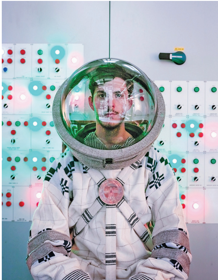
Figure 8: Jones, H. The Welsh Space Campaign , 2013, photograph, text.

of wool as garment by miners, firemen and soldiers (Hutchings, 2013). These objects become a personal metaphor of our ancestry. This work accentuated the consciousness of the Welsh culture gradually deteriorating through the threat of losing the Welsh language, we become feeble and transcendent. Through the notion of sending the Welsh into space it demonstrates that Wales as a nation has the proficiency to explore space too enabling Wales to be recognized in a wider context (Jun, 2013).