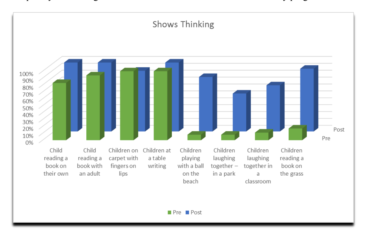
Figure 1: Children's views of whether an activity shows thinking pre- and postintervention

At the end of the study, children's views on the types of activity that involved thinking showed a marked difference from the initial visit. They selected a wider range of photographs, including those in non-classroom contexts compared to the initial visit as showing thinking. This may indicate that the children had become aware of the complexity of thinking and better aware of its varied nature as the study progressed.