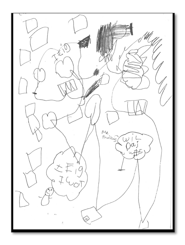
Drawing 3 Child's representation of thinking as 'a muddle'

When asked to talk about what their drawings showed, nearly all of the children made very general comments and typically said that they had drawn pictures of them thinking about being 'good', 'kind' or 'nice' – ie they focused on behavioural features. Most said that they were good at thinking. Three noted that sometimes it made them tired. When asked to explain why that might be the case, two children said that it was because it is hard. The third, said it was because thinking is 'complicated', and suggested that it was tricky to think – and also tricky to talk about what it was like to think. This child said 'I just don't know what thinking is so I have drawn a muddle'.