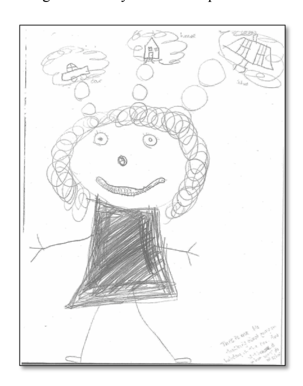
Drawing 2 Child's drawing of 'What I think about'

When asked what was happening, the child said that 'This is me thinking about things. That's my thinking coming out' (pointing to cloud). The children were able to indicate thinking using the symbol of a bubble or a cloud, but not elaborate on what happens when they think. In 86% of the pictures the children drew a single thought coming from their head, and reported that they could only think about one thing at a time. In the following drawing, the child drew a picture that indicated that thinking could be about various things. The child also used a familiar representation of thinking – bubbles coming from the head, but these showed thinking 'about school, home and the car'. This child could not explain in any more detail what happened when she thought, or tell me any of the strategies that she might use when thinking. Thinking about multiple thoughts was only seen in two pictures.