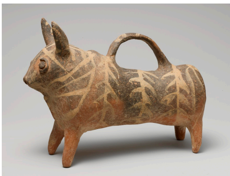
Figure 3. Base Ring “bull” rhyton, Cesnola Collection, 74.51.826.

Inevitably, as demand for Base Ring tableware increased, by LC II the potters chose to use a more robust paste with a coarse grain, albeit still unsuited for throwing on the wheel, which allowed them to rapidly form the requisite vessels. Alongside this, there was a remarkable standardization of form, contracting to simple small juglets and carinated cups [43]. Moreover, while the earlier vessels were slipped and had a very lustrous or metallic finish [50], the later products of the workshops were either left unslipped or were dipped in a matte slip [43]. The earlier vessels might have relief or incised relief decoration, typically wavy lines or spirals, while some of the later matte-slipped vases might have linear white painted decoration. The apparent decline in production in LC II reflects the properties and capacities of the new clays and slips and demonstrates an ongoing dialogue between materials