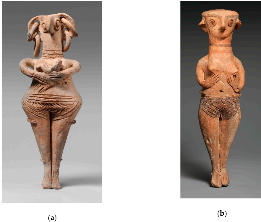
Figure 4. (a) Base Ring earring/bird-faced figurine, Cesnola Collection, 74.51.1542. (b). Base Ring flat-headed figurine, Cesnola Collection, 74.51.1549.

and potters, as the latter responded to changing social worlds and the needs of mass production. Intriguingly, despite the need to rapidly produce their vessels, the preference for clays more appropriate for handmade production persisted.