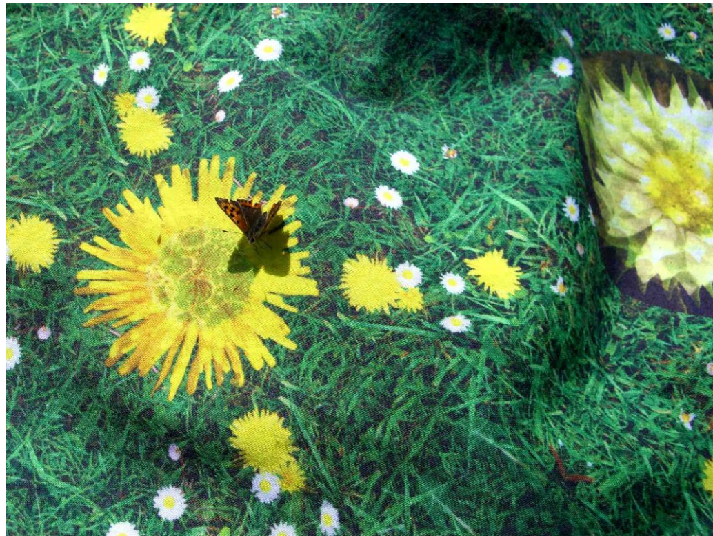
Testing engineered nectar coating on Daywear for Butterflies