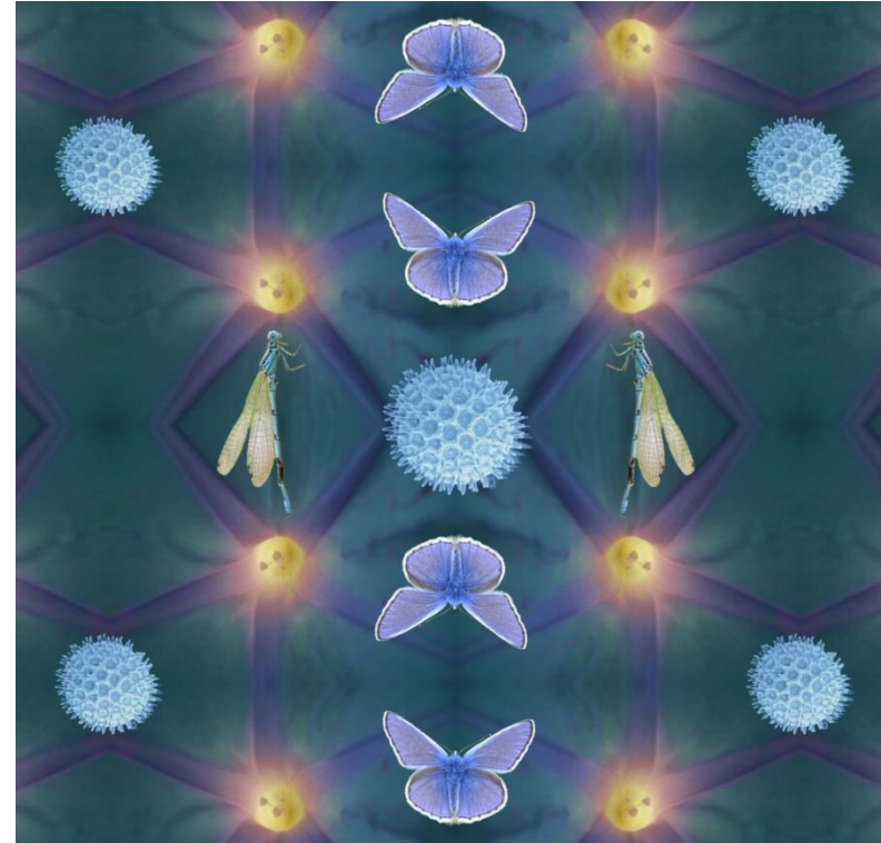
Scabious and Poppy Shirt and Morning Glory Skirt

Examples of the eight digital designs incorporating the electron scanned microscopy images of pollen grains