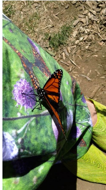
Monarch Butterfly on Pollinator Frock, networked performance, SCANZ-Eco Sapiens, New Zealand 2011