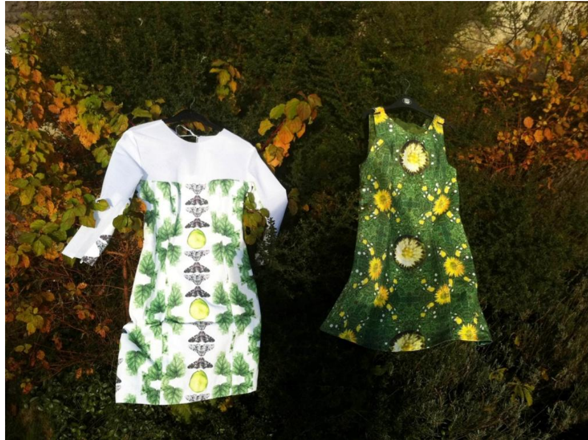
Pollinator Frocks – Eveningwear for Moths and Daywear for Butterflies