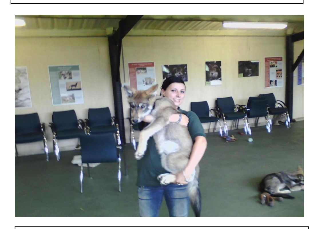
Figure 8: Work experience student in process of retrieving Nuka from tables and chairs in the Education Centre.