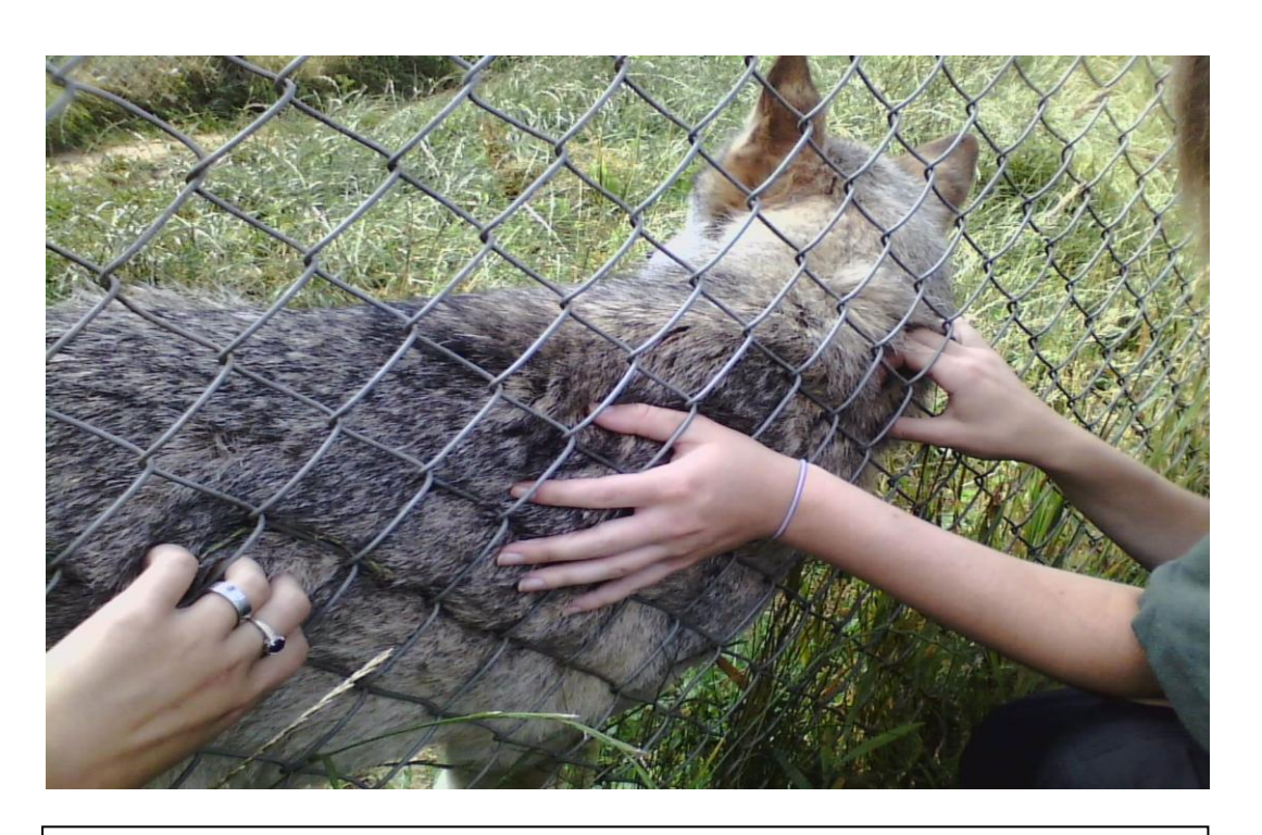
Figure 10: Showing how interaction can be maintained even when access to an enclosure is unsafe.