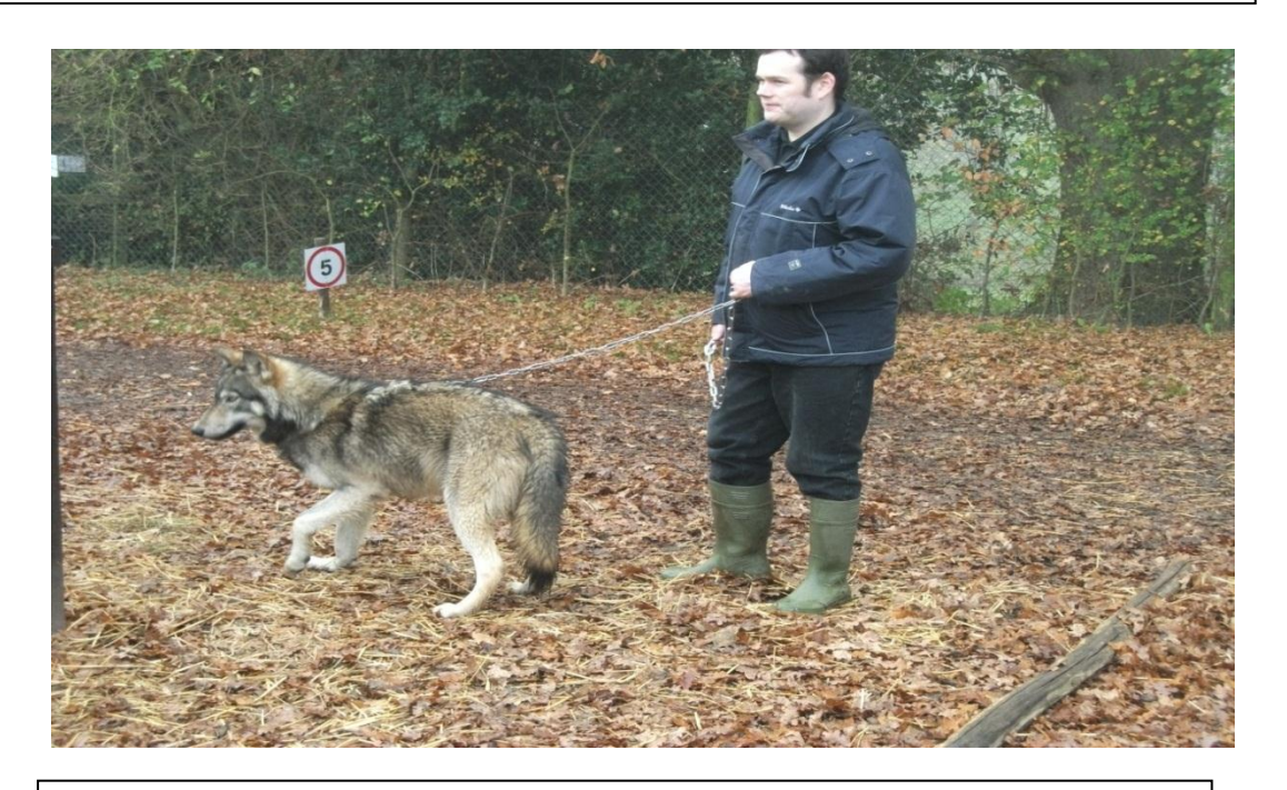
Figure 4: One of the Beenham cubs ready to go on a training walk, soon after this photo two handlers were allocated to each wolf cub.