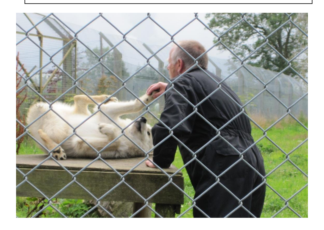
Figure 6: Arctic cub showing submissive behaviour to the wolf keeper.