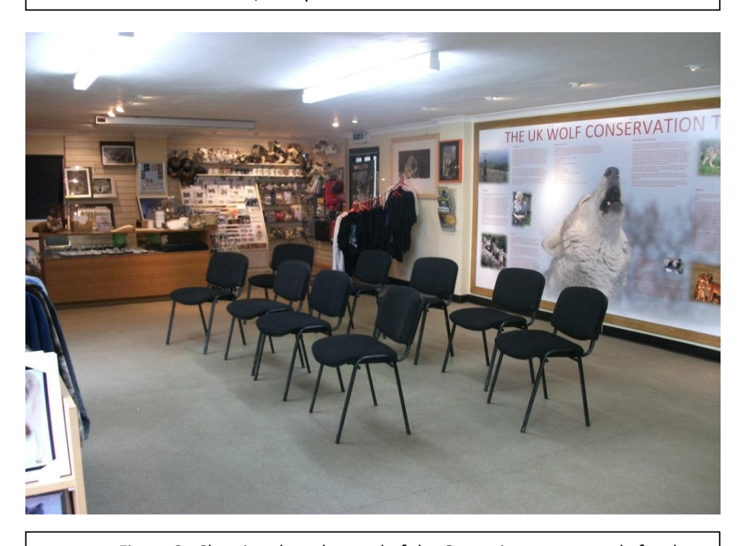
Figure 2: Showing the other end of the Operations room ready for the members walk. The most frequent role I undertook as a participant observer was assisting in setting up before and tidying up afterwards and helping with refreshments.