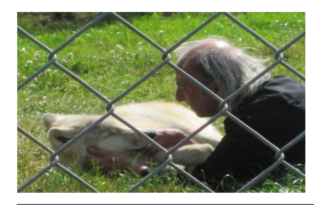
Figure 5: A senior handler in close contact with one of the Arctic cubs in quarantine.