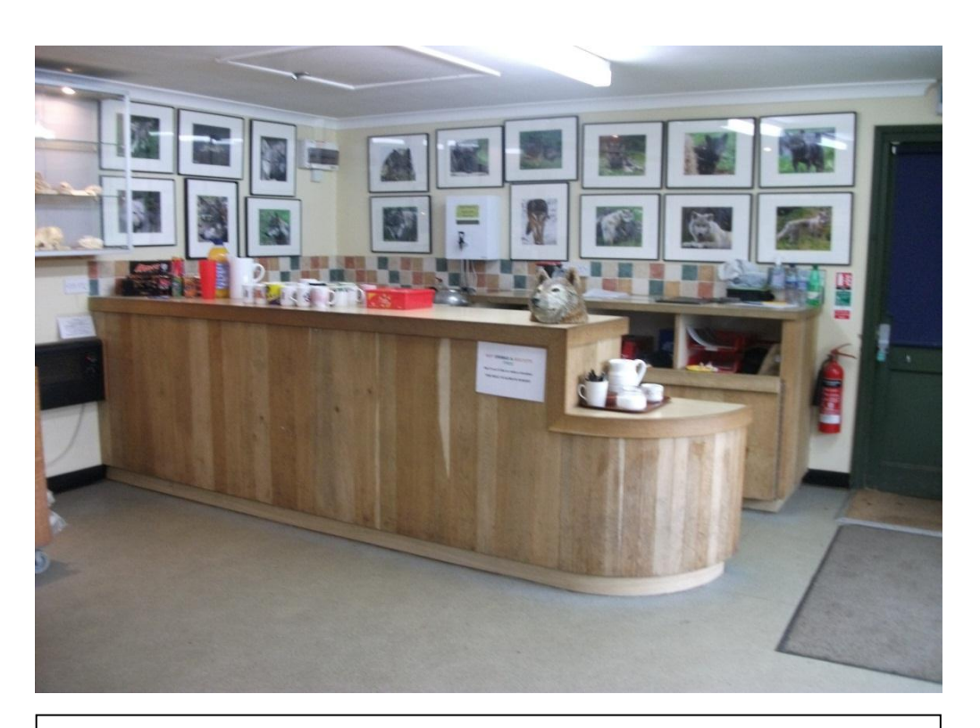
Figure 1: Showing one end of the Operations room at the UK Wolf Conservation Trust, set up for refreshments after a members walk.