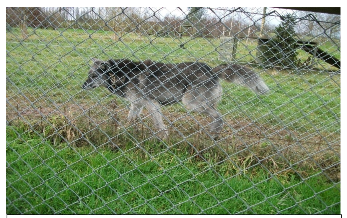
Figure 3: Mosi indicating her dislike of my presence with raised hackles and a tail carried high. This behaviour would often be accompanied by vocalisation.