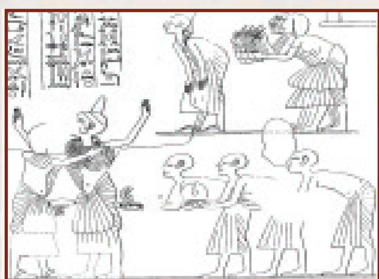
Figures 1 & 2 - 'Meryra rewarded' situated on the East part of North wall (lower register).