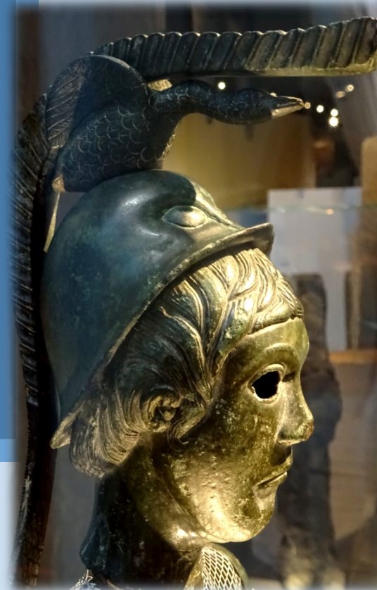
2nd-century bronze statue from Brittany, presumed to be Brigantia (Musée de Rennes)

The inscription above makes a connection between Brigantia and the Roman goddess Victoria, the personification of victory, who was central to Roman ideology as patroness of war. Does this point towards Brigantia as a war goddess? The opposite might be more plausible: Victoria also brings peace and prosperity, hence we might need to insert Brigantia into this context. The bronze statue (right) is a representation of Brigantia, hybridizing features from the Roman Minerva and the indigenous goddess. Minerva often takes on the role of Celtic mother goddesses since she has similar functions to those ascribed to Brigantia and Brigid, notably as bringer of prosperity and fertility.