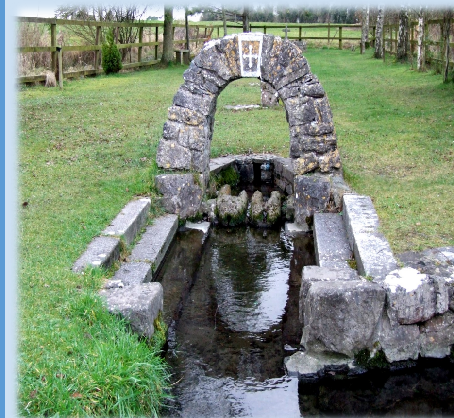
Well of Brigid, County Kildare, Ireland. The waters are suspected to have healing properties, having been blessed by St Brigid.