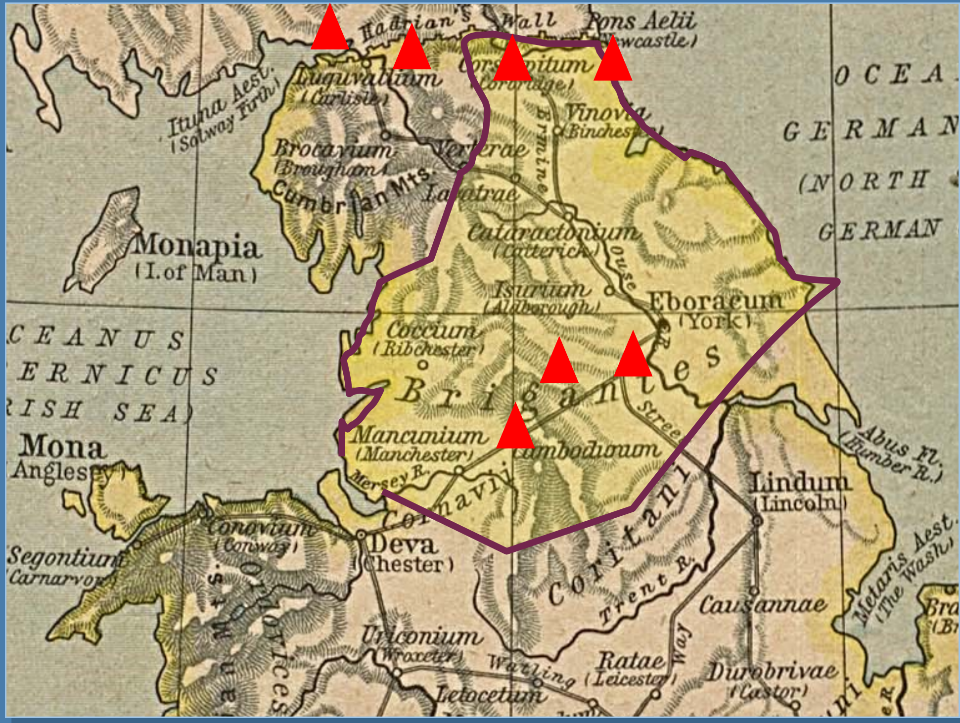
Brigantia dedications in the territory of the Brigantes